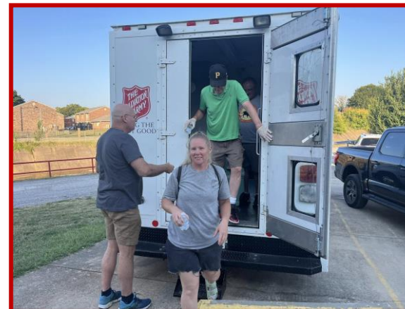
Trinity's Young Adults helped serve from the Salvation Army Canteen.